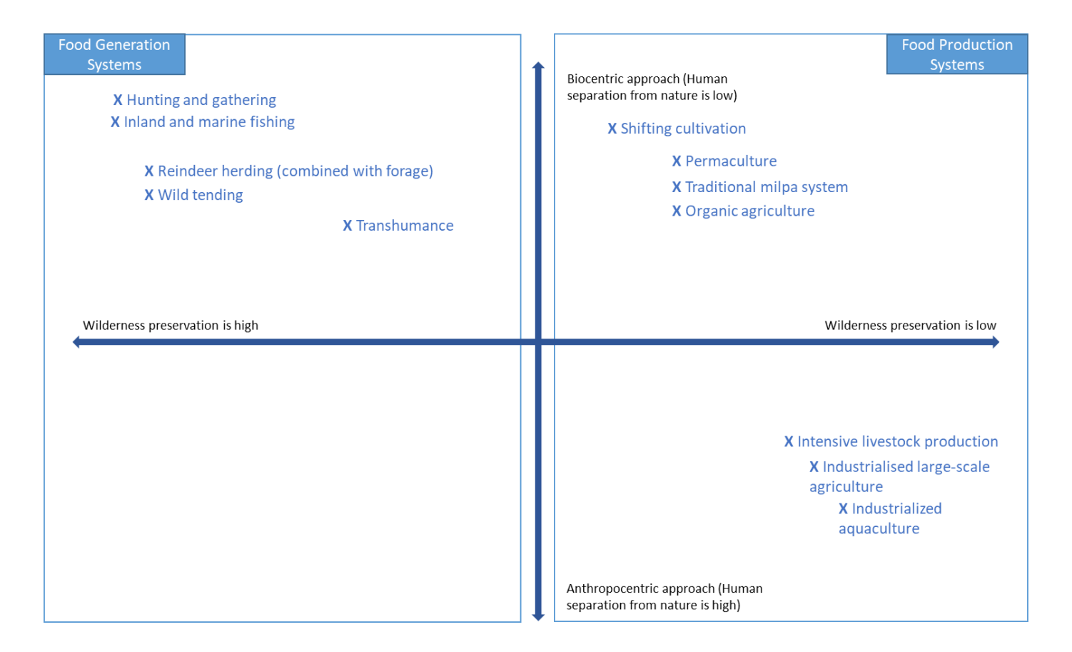
Figure 2: Example of food systems regarding the level of human intervention on the ecosystem and the approach underlying territorial management choices (anthropocentric, biocentric).

Indigenous Peoples' food systems are efficient in their use of resources, with no waste and circulation of resources. Indigenous Peoples' food systems are efficient in using food and other resources, with zero or minimal waste generated and wide circulation of resources, products and non-monetary wealth within communities, as exemplified by the rule of "take only what you need and share the excess". All the materials used tend to be fully utilised and recycled locally. In their food system, Indigenous Peoples reuse organic matter for agricultural production, which they consider as a resource more than as a waste (FAO and the Alliance of Bioversity International and CIAT, forthcoming-a). In contrast, recent studies on food loss and waste have calculated organic waste from global, conventional food systems equates to 1.3 billion tons of waste per year (FAO, 2020a). Another commonly held belief and practice amongst Indigenous Peoples is to use all parts of the plant or animal harvested, to fully honour the life given. The Inuit make walrus ivory artwork and sealskin clothing, and their crafts represent a full expression of their culture and respect for the gift of marine mammals. Their craftwork is also an important economic feature and expression of cultural identity of their subsistence hunting.